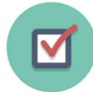
Search Relevance A