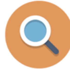
Business URL Collection A