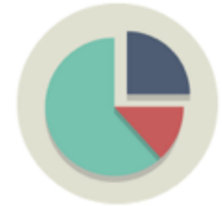
Basic Demographic Survey